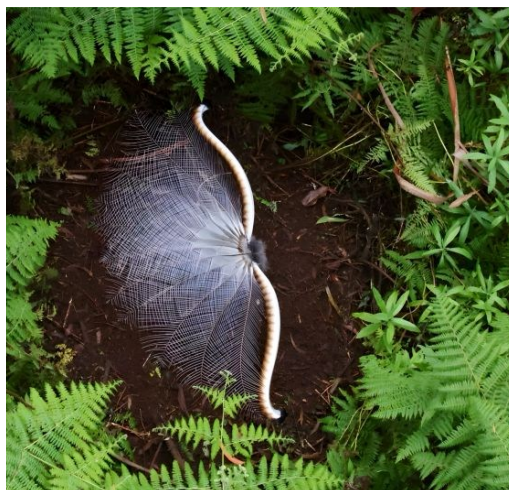
HC: "Lyrebird" by Joan Fawcett Image of the month